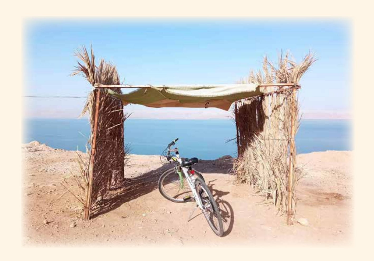
"A man is a true man when he is on the road!" Penio Penev